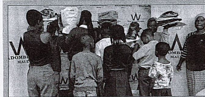
The Siku Sport Club donated stationery and uniforms to learners at the Tondalushaka Drop-in Centre in Madombidzha and Kutama on 22 January.